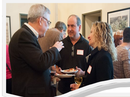
One and all enjoyed the evening!